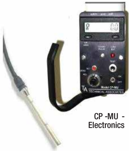
CP -MU - Electronics