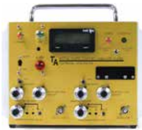
PRS-7-DSC Electronics SSS-22P and LR