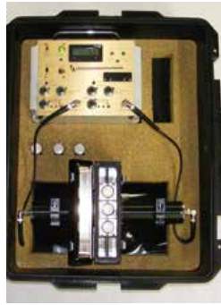
SSS-22PAL Suitcase Version ALL-IN-ONE