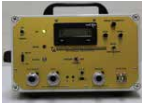
PRS-7 Electronics SSS-12P-1